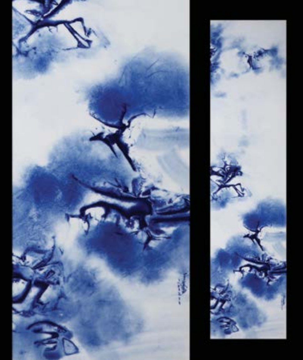
GAN DAOFU, BOUNTIFUL LAND, 2012