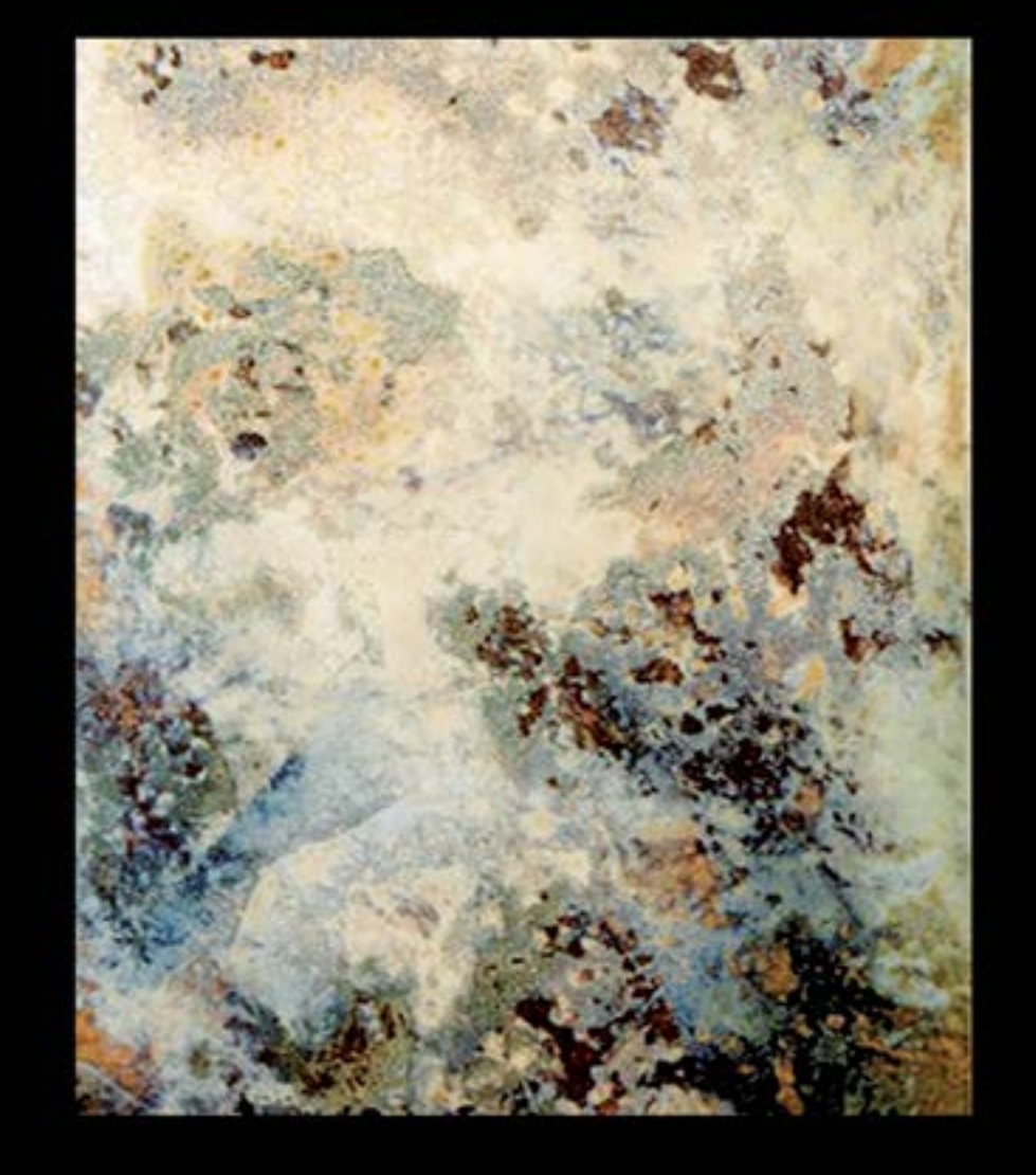
ZHU DI, SNOW AT DUSK: AFTER MI YOUREN, 2013