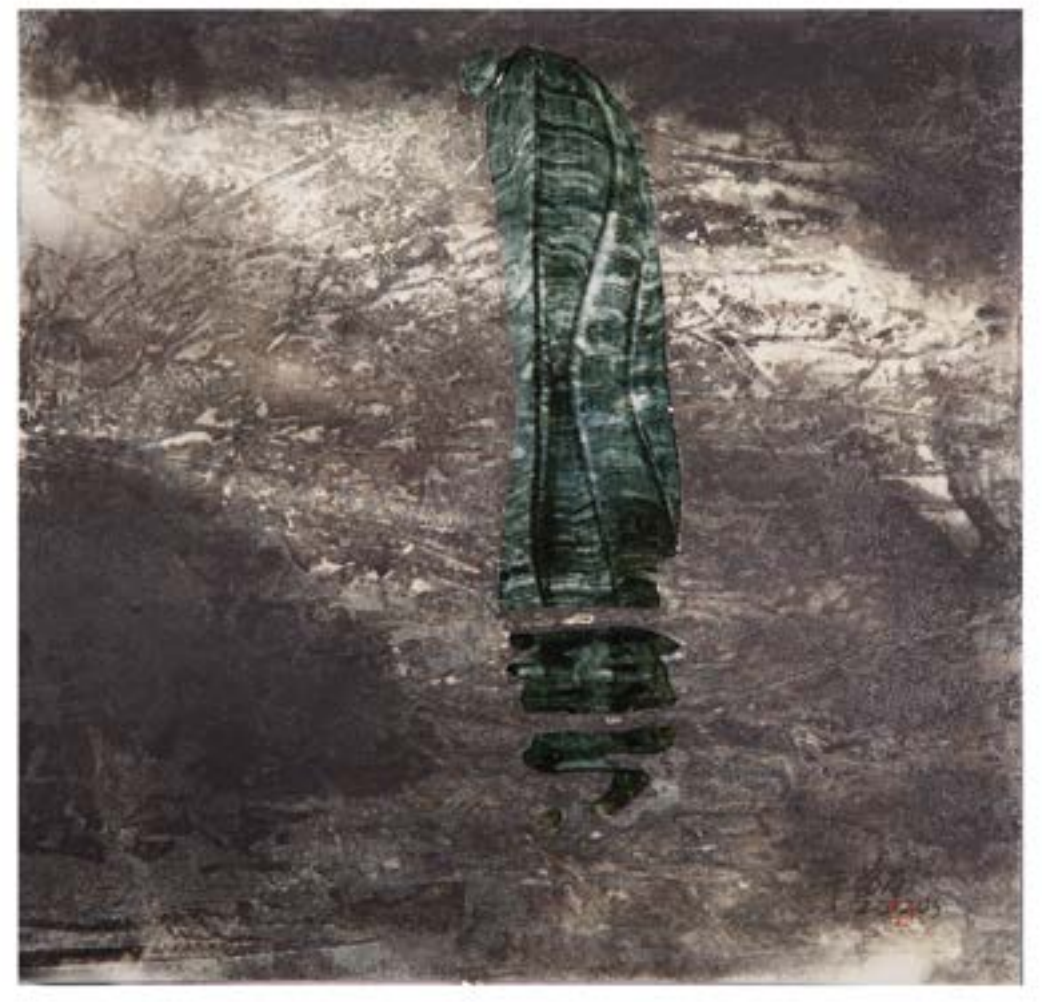
GAN DAOFU, FOG TOTEM II, 2012