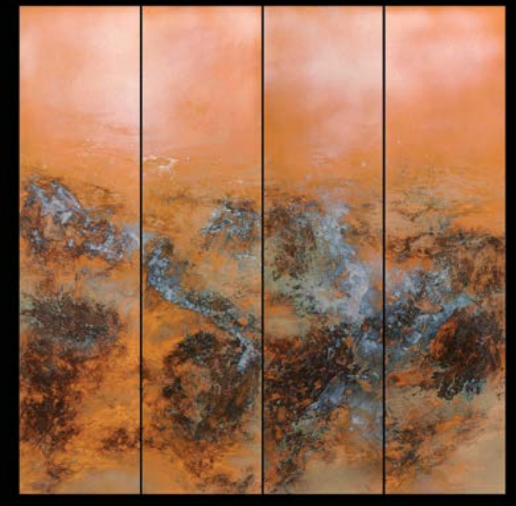
ZHU DI, EVENING MIST, 2012