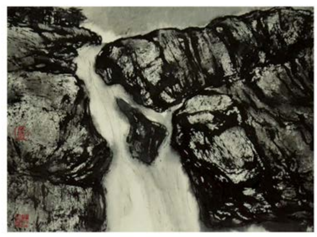
MANSHENG WANG, WATERFALL III, 2011