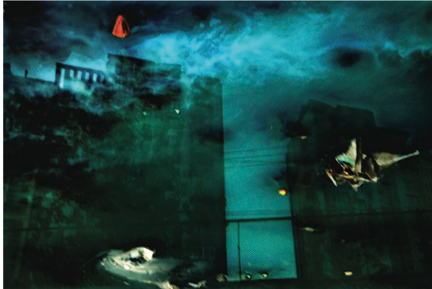
MOON STAINED DARKNESS, 2005, SINGLE EXPOSURE C-PRINT ON ALUMINUM, 40 x 59 INCHES