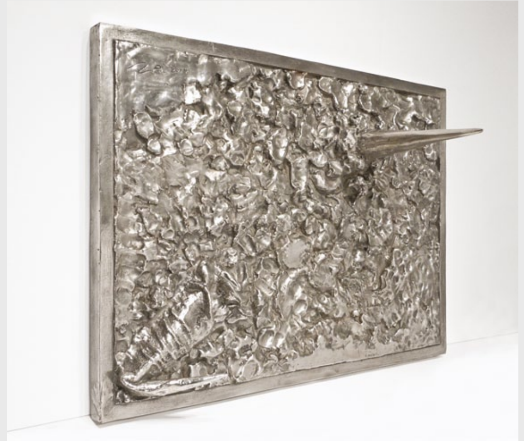
Zhou Rong, Awn-1 , 2014, White Bronze, 49.5 x 68.6 cm.