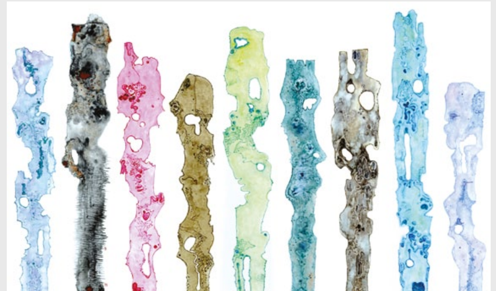
Zhang Guojun, Beyond Mountain Series , 2013, 9 Porcelain Panels, 175 x 34 cm each.