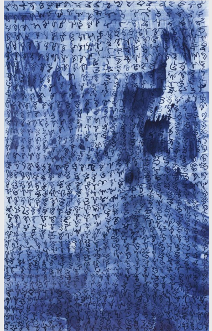
Jared FitzGerald, Writing II , 2014, Porcelain Panel, 160 x 99 cm.