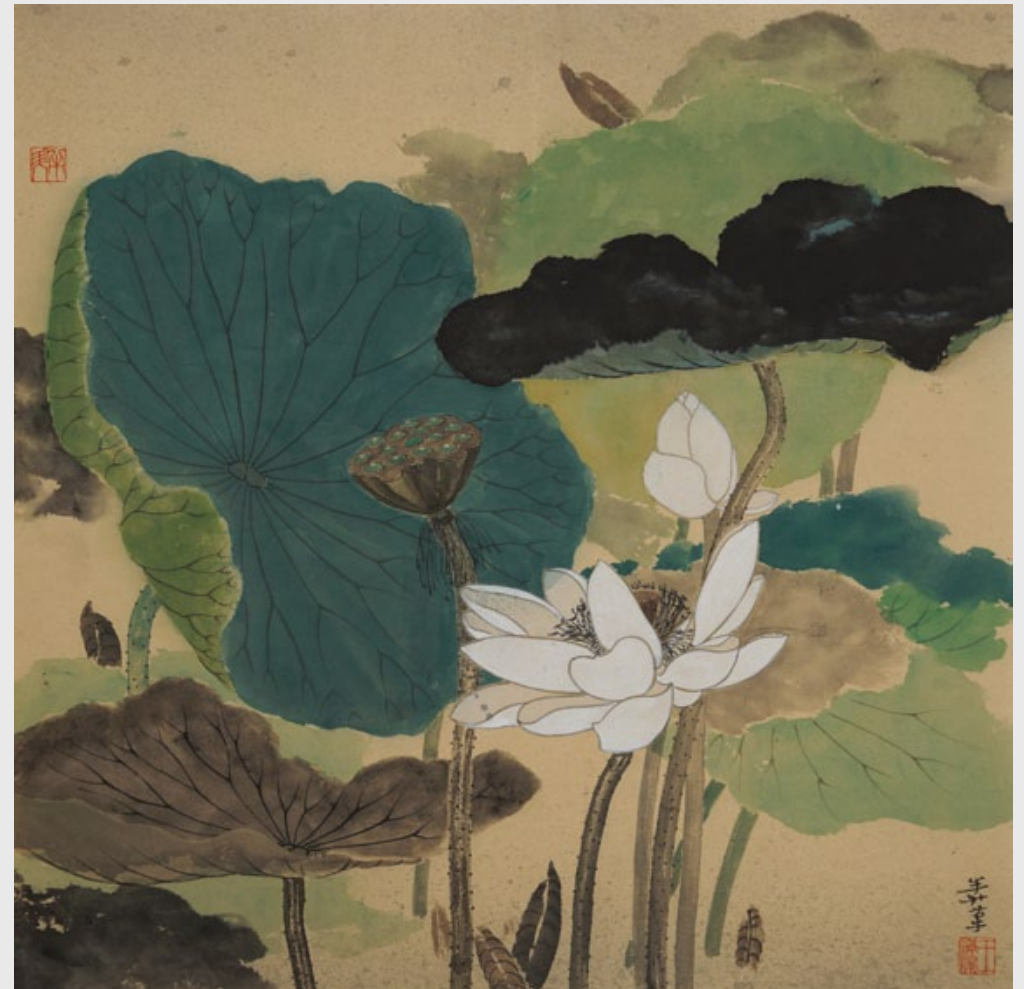
Mansheng Wang, White Lotus 1 , 2013, Ink and Colour on Paper, 69.9 x 69.9 cm.