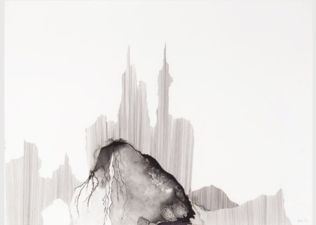
Burcu Oz, Untitled 3 , 2009, Ink and Charcoal on Paper, 55.9 x 76.2 cm.