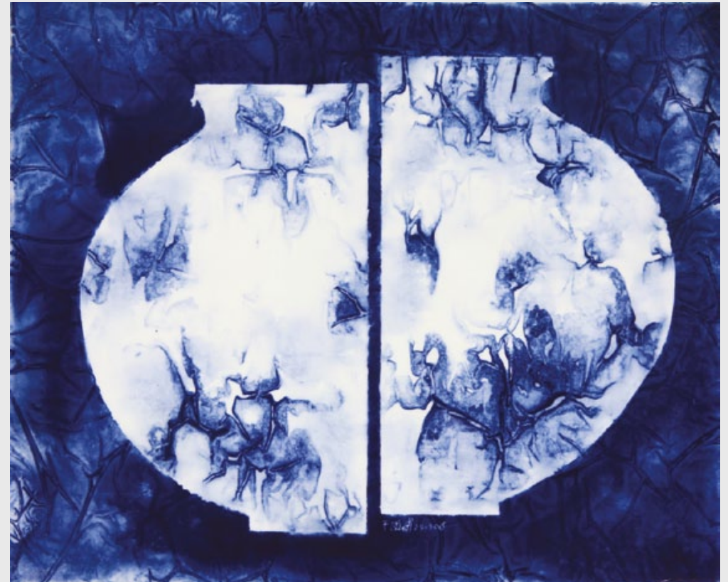
Gan Daofu, Link 1 , 2013, Porcelain Panel, 45 x 55 cm framed.