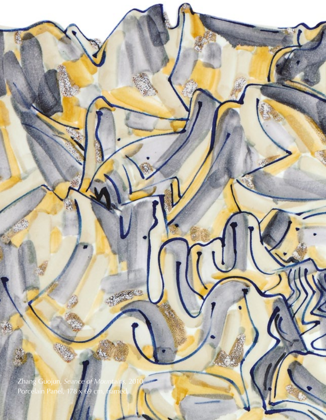
Zhang Guojun, Seance of Mountains , 2010, Porcelain Panel, 178 x 69 cm, framed.