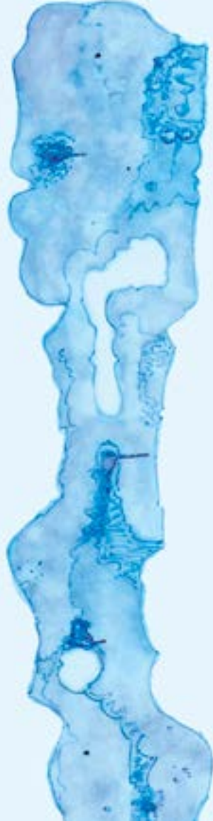
ZHANG GUOJUN, BEYOND MOUNTAINS XX, 2013