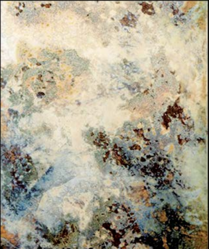
ZHU DI, SNOW AT DUSK: AFTER MI YOUREN, 2013