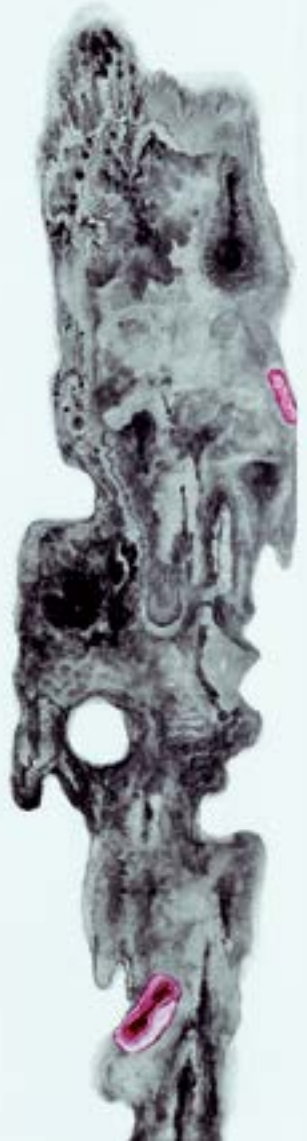
ZHANG GUOJUN, BEYOND MOUNTAINS XXIV, 2013