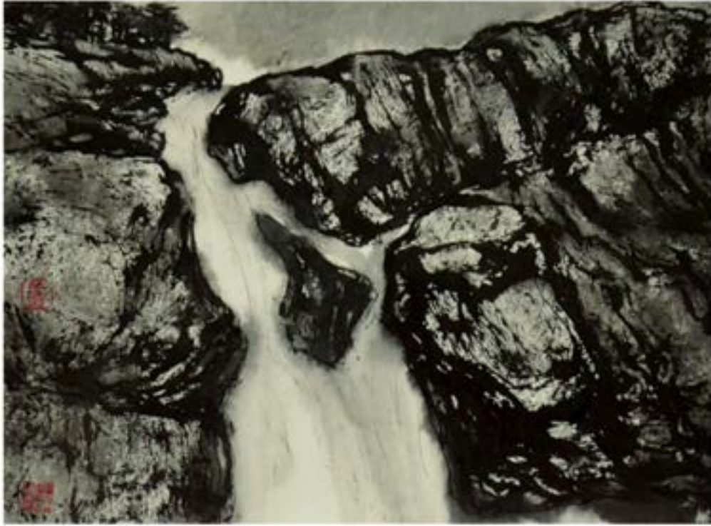
MANSHENG WANG, WATERFALL III, 2011