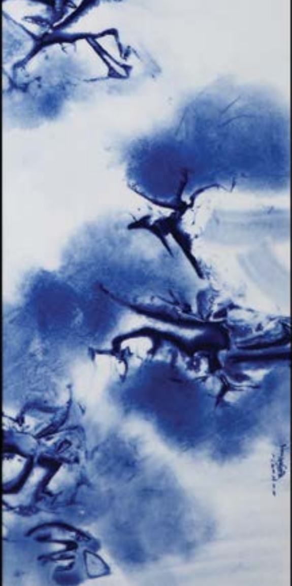
GAN DAOFU, BOUNTIFUL LAND, 2012