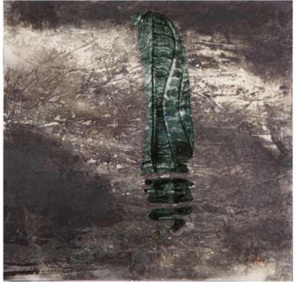
GAN DAOFU, FOG TOTEM II, 2012